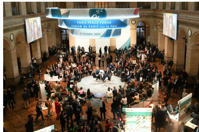
Inspirational example: Paris Peace Forum

creating a safe and sacred space for wisdom-led and spiritually-elevated dialogues, on complex and polarizing issues – from AI to peaceful global coexistence – where reconciliation of perspectives and repurposing of organizations are urgently needed