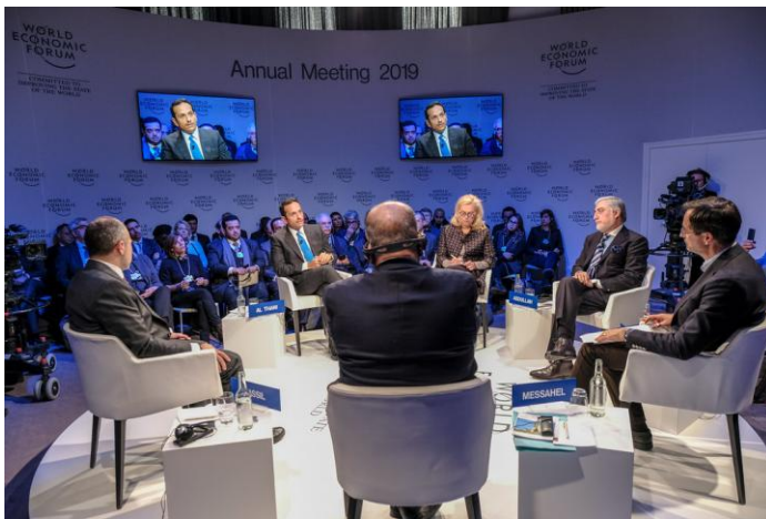
Inspirational example: World Economic Forum