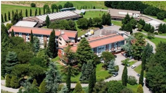
Inspirational example: Sophia University Institute