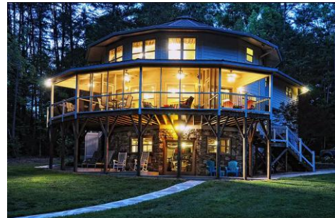
Inspirational example: Deltec's round homes

A splendid meeting point for the partners of the alliance; a groundbreaking community of practice and foremost leadership school for the new world; a welcoming place where the alliance meets the rest of the world