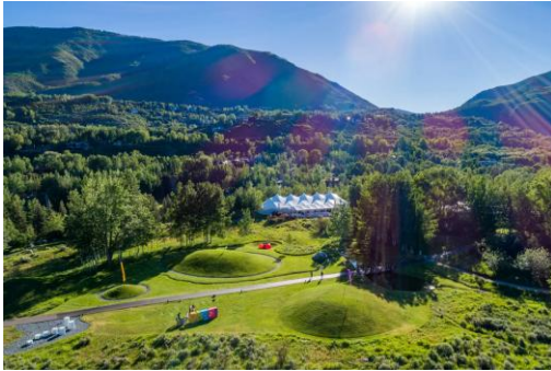
Inspirational example: The Aspen Institute's campus