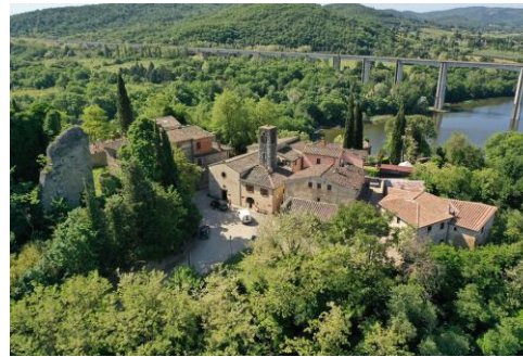
Inspirational example: Rondine, Citadel of Peace