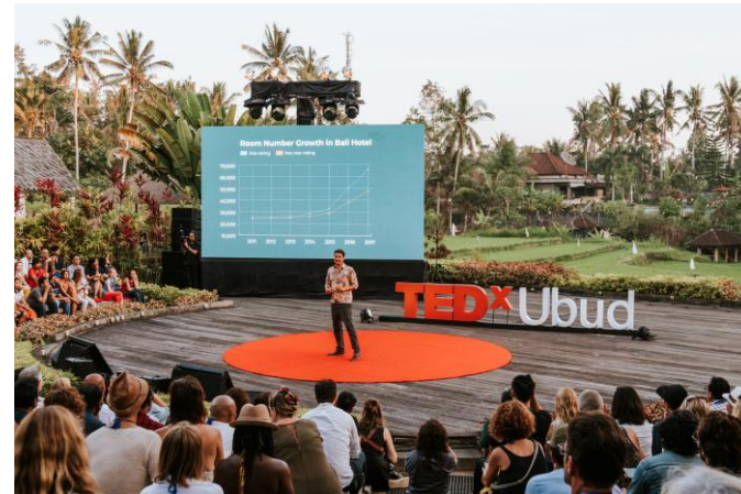
Inspirational example: Ted Talks locally organized event

...serving as a pathway to bring a new life-affirming and spiritually-elevated education to the world, through the highest quality standards and the bottom-up engagement of local communities across the globe